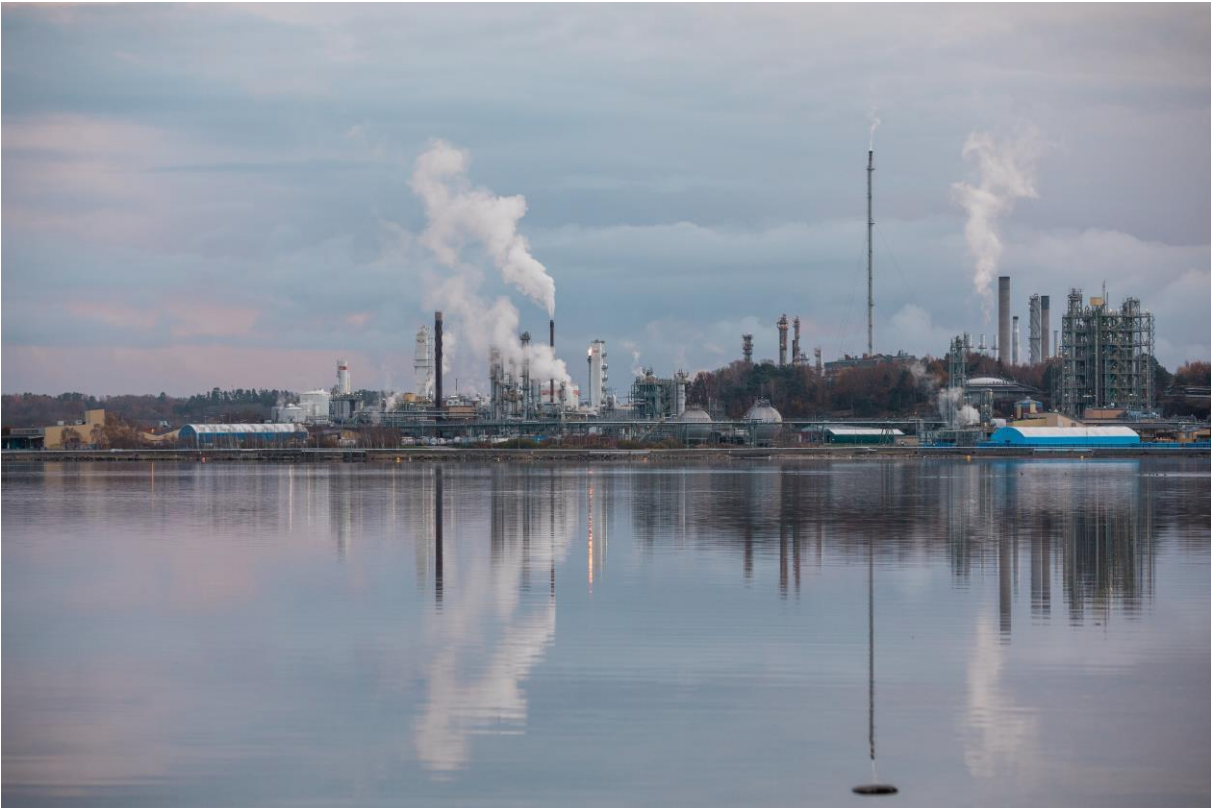
Figure 5. Water pollution and contamination from industry are important issues that needs to be adressed within the Water Framework Directive and an important topic that were discussed during the Nordic meeting.

solutions for these. Denmark seeks to minimize the long-term impact of PFAS on health and the environment, setting a model for comprehensive PFAS management. The intense public attention and political awareness has created an open window for acting on the matter.