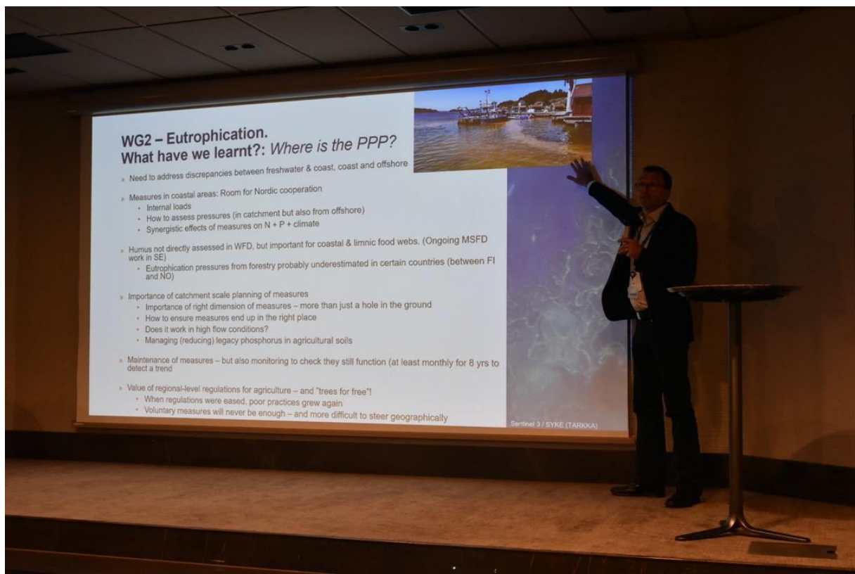
Figure 6. During Day 2 of the Nordic meeting specialists directly involved in Nordic implementation of the Water framework Directive met in working group sessions focusing on specific implementation areas, such as hydromorphology, eutrophication, hazardous substances, and innovative monitoring technologies.