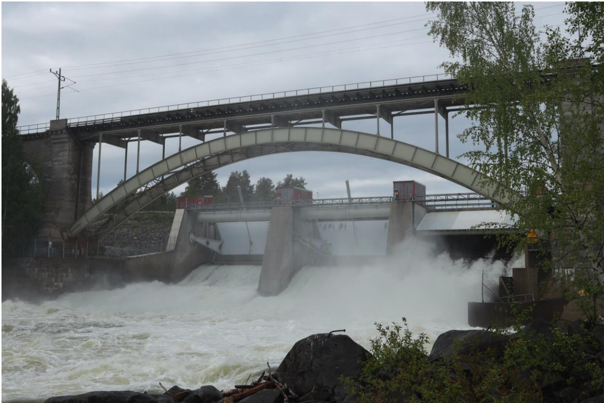
Figure 3. Hydropower is highly important for the energy production but has large ecological impacts on, for example, migratory fish movements. Hydropower plant Sikforsen and railway bridge in Pite river Sweden.

A significant part of the presentation focused on defining what constitutes “disproportionately expensive”. The Swedish guidance requires that the costs of reaching good ecological status exceed the benefits significantly, with both qualitative and quantitative costs considered. The margin for disproportionality must be substantial, typically requiring that the lowest achievable cost is at least double the maximum estimated benefit. The guidelines provide Swedish water authorities with a framework to manage modified water bodies responsibly, ensuring that efforts are impactful, cost-effective, and aligned with European standards.