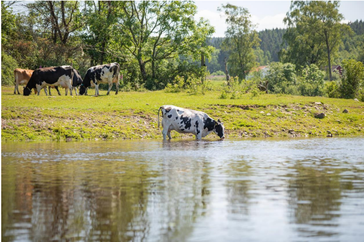
Figure 4. Measures to improve water quality, restore ecosystems, and manage land use and recreational activities in agricultural areas was discussed during the Nordic meeting.