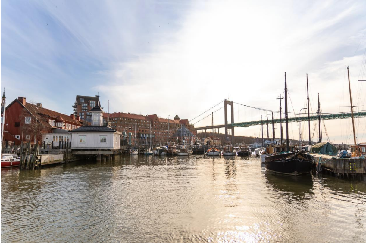
Figure 2. View from Gothenburg harbour area and Göta Älv close to the venue of the Nordic water framework directive (WFD) meeting in September 2024.